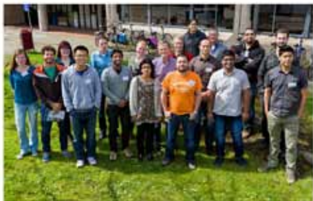
5th Advanced proteomics 29 April - 1 May 2015 Wageningen, The Netherlands

During 2015, NuGO (co-)organised or supported the following courses: