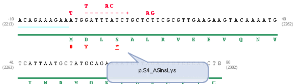
Figure 1 The standard view of VariVis displays the gene sequence horizontally across the screen with nucleotide variants above the sequence track. Annotations are displayed as coloured tracks below the sequence with the amino acid sequence below; variation within the amino acid sequence is also displayed. On-screen tools allow the user to change the magnification of the graphic, change the range being displayed or to switch between the two views.

stream of data. Theoretically, it is possible that any given nucleotide in a gene can be mutated to any other nucleotide base, deleted entirely, or have an adjacent insertion. Thus, the "Gel View" displays all possible nucleotide combinations for each position, a novel strategy, highlighting the nucleotides present in the reference sequence and any variations in contrasting colours. A horizontal version of this format is also available (not shown).